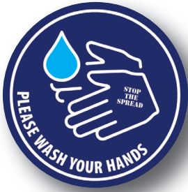
FLOOR DECAL Item #: DGI1212WHC SIZE: 12 X 12 PRICE: $6.95/ea

Working together to promote healthy physical distancing, we can stop the spread