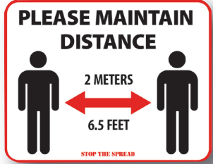
WALL DECAL Item #: DGI2016PMD SIZE: 20 x 16 PRICE: $14.95/ea