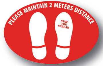
FLOOR DECAL Item #: DGI1812OVMTR SIZE: 18 x 12 PRICE: $10.49/ea