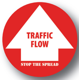
FLOOR DECAL Item #: DGI1212TFC SIZE: 12 X 12 PRICE: $6.95/ea